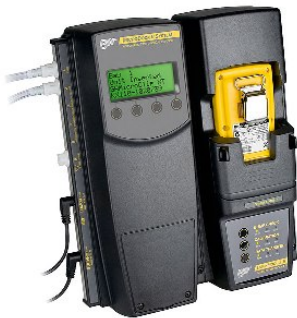
MicroDock II with module for GasAlertMicroClip detectors. (up to 6 modules on one base station)

(Note: when using Fleet Manager II software version 3.4.2 or lower (older), GasAlertMicroClip XL model detectors will simply appear as a GasAlertMicroClip XT detectors in the reporting. To have updated reporting labels, simply download the latest version of Fleet Manager II software from our website.)