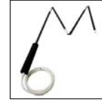
Collapsible sampling probe

For a complete list of accessories, please contact BW Technologies.