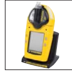
Integral pump and battery charger